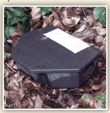
Tamper-proof bait station.