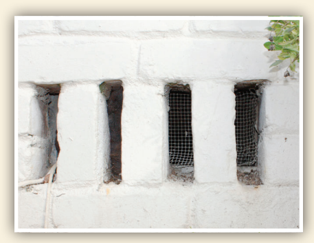
Check for loose mesh in foundation vents.