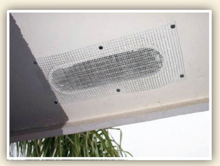
Soffit vent hole sealed with screen.*