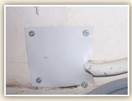
Power supply hole sealed with metal flashing.*