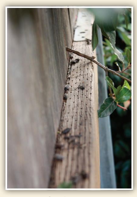
Droppings on fenceline.