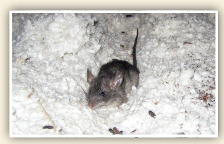
Rats often use the same trails repeatedly.*