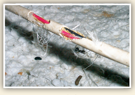
Gnawing on wires with droppings.*