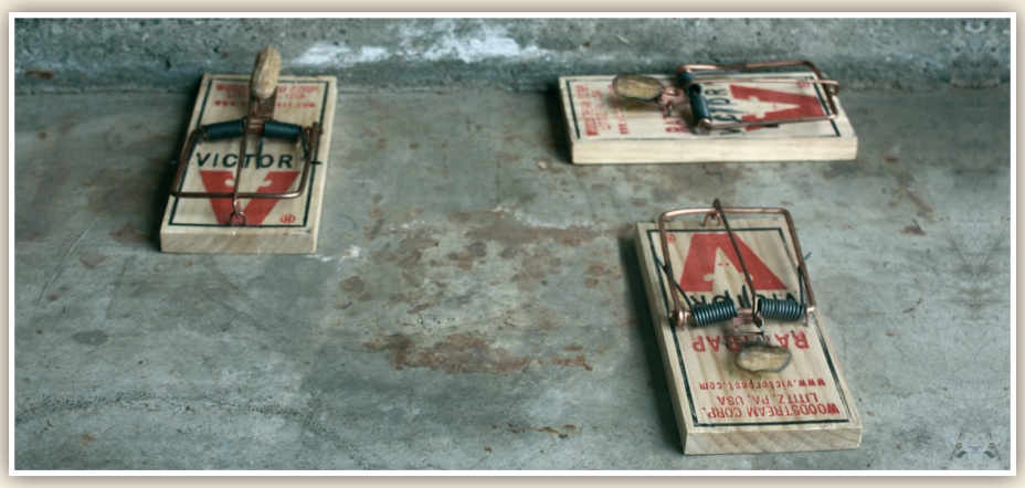
Properly placed traps at floor level.