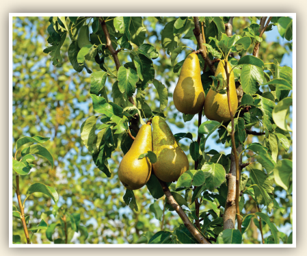
Watch for signs of rats such as hollowedout fruit either on the ground or still attached to the tree.