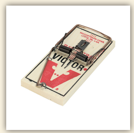
Rat-sized snap trap.

Rodent "snap traps" are inexpensive and are available in two sizes. The smaller trap is designed for mice and the larger is designed for rats. It is very important to choose the proper size trap. Several rat traps should be set to maximize trapping effectiveness.