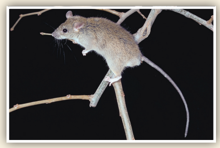
Roof Rat (Rattus rattus)**

NORWAY RAT Rattus novegicus (also known as Wharf, Sewer, Brown, Common)