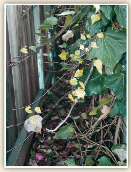
Ideal rat nesting area: dark space between fences covered with ivy.