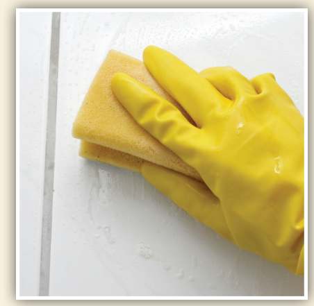
Always wear protective gloves when handling or cleaning rodent evidence.

Once the newly cleaned area is dry (in approximately 30 minutes) it's ready for reuse.