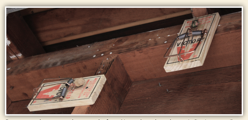
Proper trap placement on beams and rafters. Note rub marks on beams indicating rat trails.

The working parts of the trap should be oiled occasionally using mineral oil never petroleum based oils such as 3-in-1 or WD-40. These oils may act as a repellent to rodents. Never store traps near insecticides or other chemicals, or handle domestic animals or pets before setting out traps. This can cause traps to take on a repellant odor.