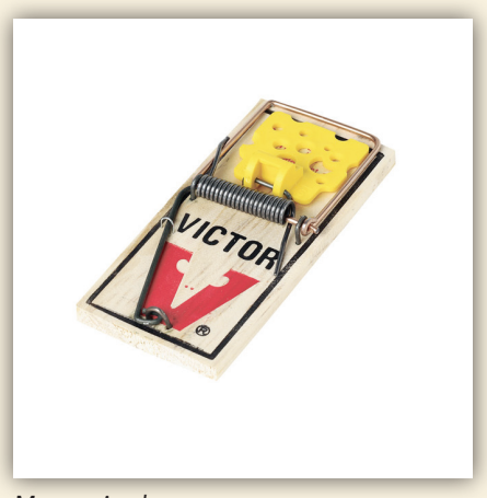
Mouse-sized snap trap.

Bait selection is important for trapping success. Peanut butter, nutmeats, bacon, pieces of apple, candy and moistened oatmeal are effective baits. For best results, try several different baits to see which is most acceptable by rodents.