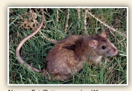
Norway Rat (Rattus novegicus)**