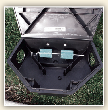
Open bait station with bait blocks.

Homeowners may purchase rodenticides at nurseries, feed stores, and hardware stores. All rodenticides should be handled carefully. Always