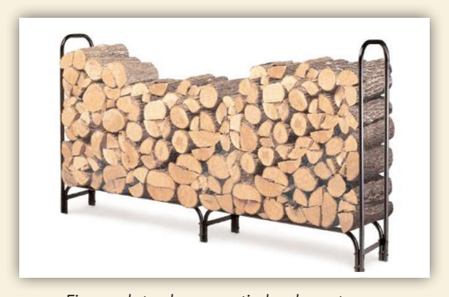
Firewood stands are practical and easy to use.