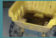
Toys left outside