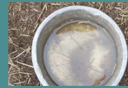
Pet bowls outside