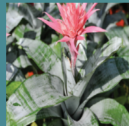
Plant axils are where leaf meets stem